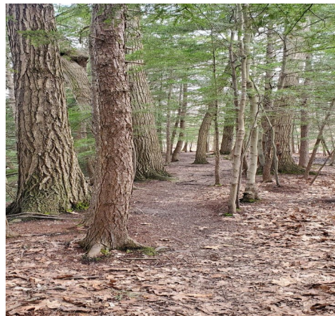
Eighteen Mile Creek Park